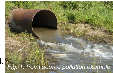
Fig. 1: Point source pollution example